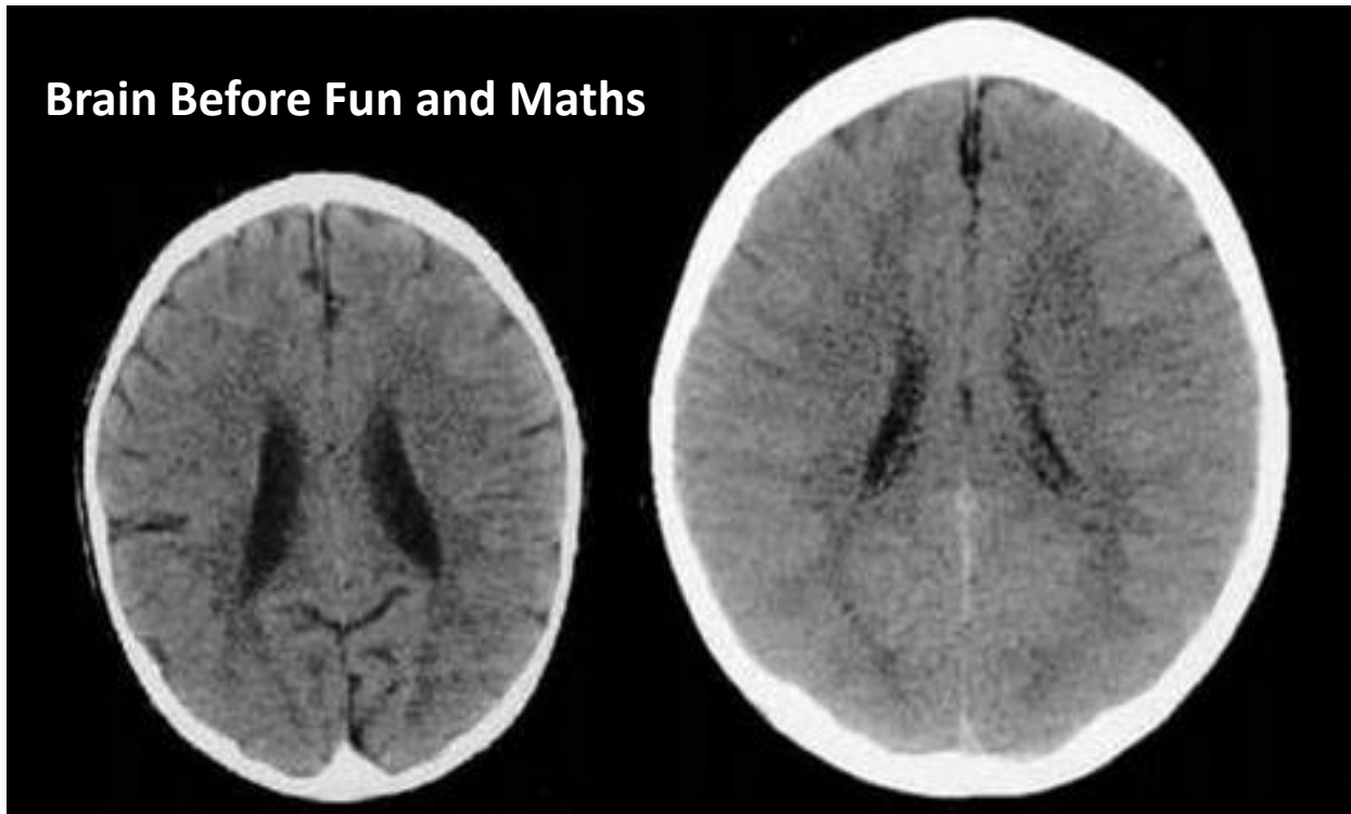
Brain Before Fun and Maths