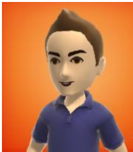
Rui de Lima e Silva Colégio Monte Flor, Carnaxide, Portugal

Learn = Explore + Assess + Create + Play